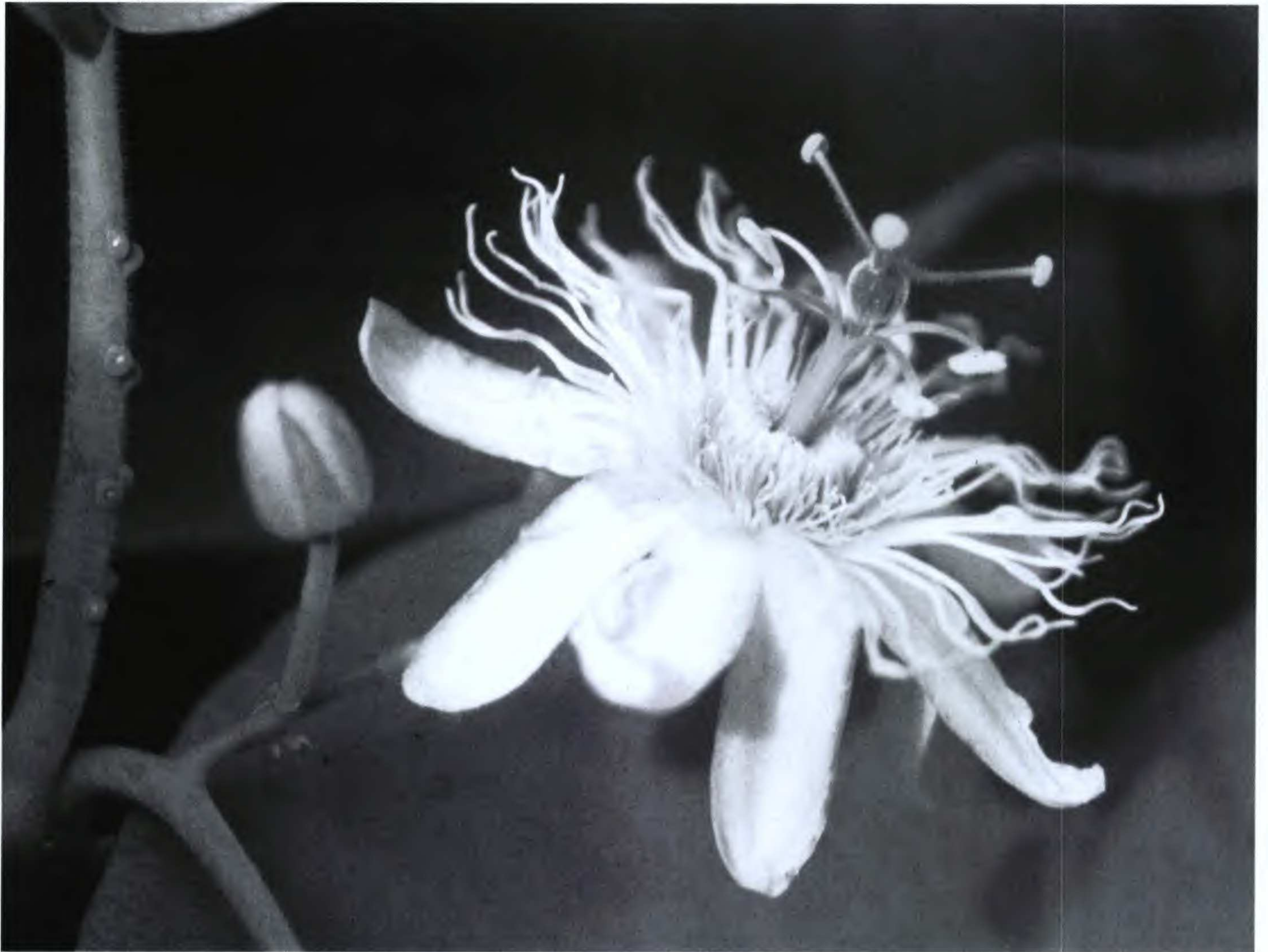
Figure 1. Passiflora lancetillensis J. M. MacDougal & J. Meerman. Flower and peduncle of clone of type material (Meerman s.n.). Note nectary glands on pubescent petiole at left.

cept stem and adaxial surface of lamina glabrous at maturity; stems terete, 0.8–3 cm diam., with chambered pith, pubescent in younger plants, glabrous at maturity except pubescence persisting near nodes. Stipules minute to setaceous, 0.4–1.0 × 0.15–0.2 mm, deciduous; petioles 8- to 11-glandular, the nectaries 1.5–2.5 mm diam. in mature plants, obloid to depressed obovoid, (petioles 6–11-glandular in juvenile plants, the nectaries narrowly cylindrical, 0.3–1.0 × 0.1–0.3 mm); laminae (8)10–16(–22) × 7–15(–19) cm, not variegated (nor in seedlings seen, grown, or collected in Belize), widely ovate to very widely ovate, unlobed, not petiolate, entire, abruptly acuminate to obtuse, often with submarginal laminar nectaries associated with the end of major secondary veins, sessile or short-cylindrical, borne 0.5–5 mm from margin; prophylls of vegetative bud 2, 0.6–1.5 mm long, widely to narrowly triangular, 3-toothed, collateral. Peduncle (common peduncle of tendril and flower) 1 per node, bearing both a tendril and 1 or 2 pedicels, 0–2(–3) cm long to the first branch, the pedicels 0.3–1.3 cm long, often 1- or 2-branched so that the inflorescence at the leaf axil is (1)2- to 4(to 6)-